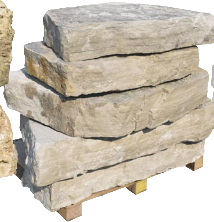
Fond du Lac Silver 5" to 8" and 8" to 12"