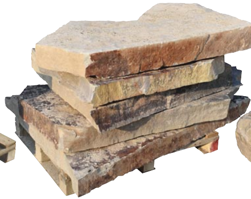
Chilton Weatheredge 5" to 8" and 8" to 12" thick