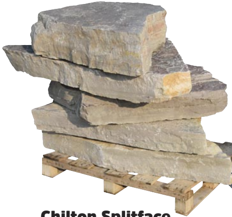
Chilton Splitface 5" to 8" and 8" to 12" thick