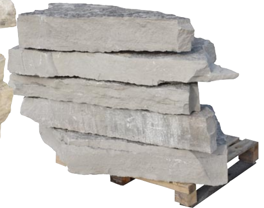
Lannon Buff or Grey available 5" to 8" and 8" to 12" size range