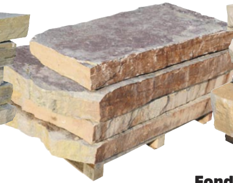
Chilton Weatheredge 5" to 8" thick