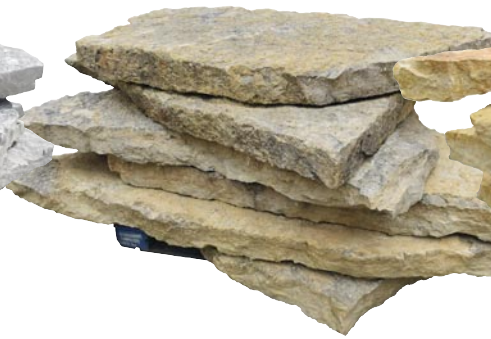
Beaver Creek Standard quarry run 4" to 8" thick