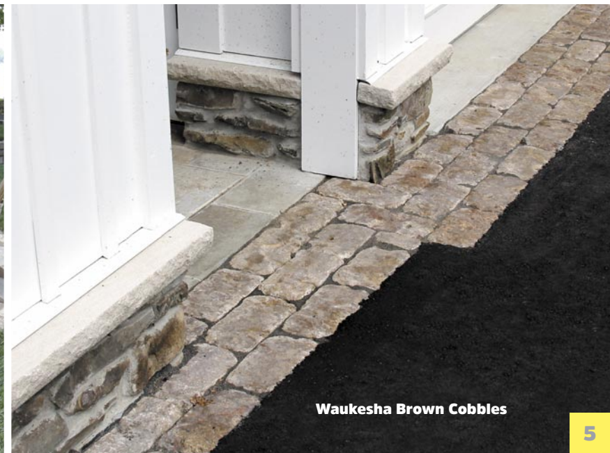
Waukesha Brown Cobbles