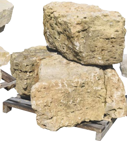
Fond du Lac Holey Boulders Random sizes