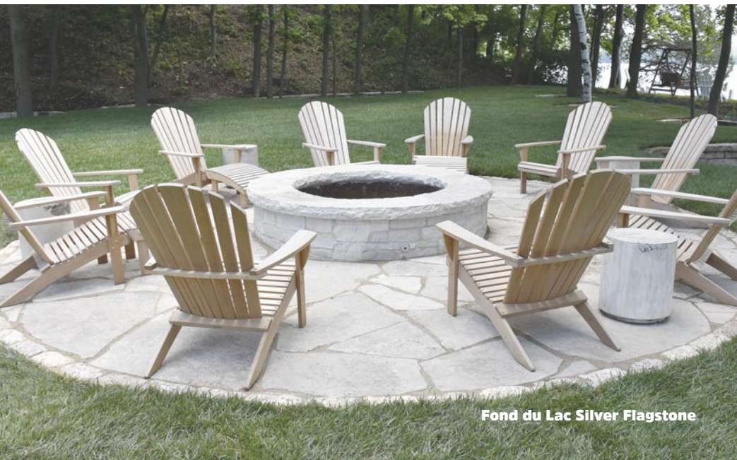
Fond du Lac Silver Flagstone