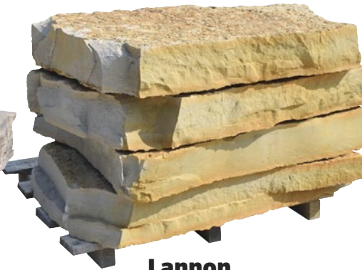
Lannon Weatheredge 5" to 8" thick