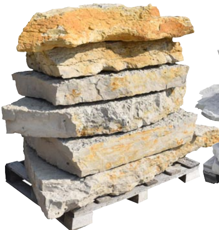
Lannon Weatheredge 5" to 8" and 8" to 12 size range