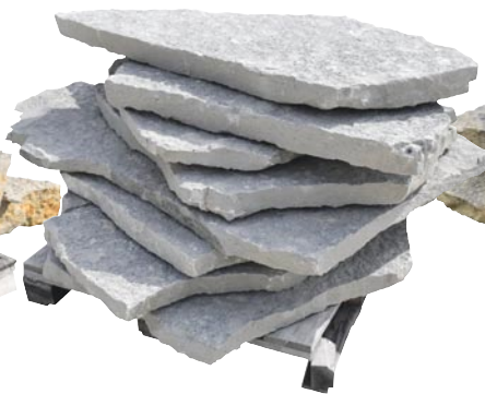
Lannon Thin Buff or Grey available 2-1/2" to 5" size range