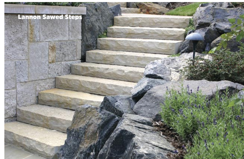
Lannon Sawn Steps

Thermal top Random Sizes | 6" thick Available with Sawed bottom or round side cut offs