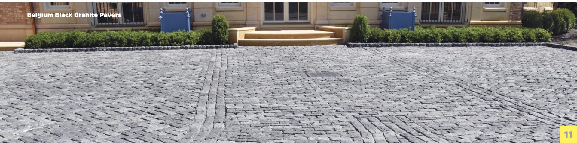
Belgium Black Granite Pavers

Roughly 8 1/2" x 5" | 5" thick Approx 30-35 saft per ton