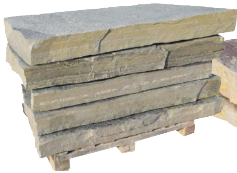
Chilton Splitface Natural quarry run 5" to 8" thick