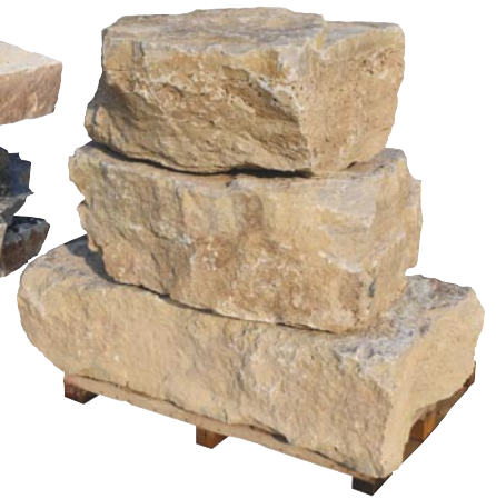
Chilton Winnebago 5" to 8", 8" to 12", 12" to 18", 18" to 24" and 24"+ thick