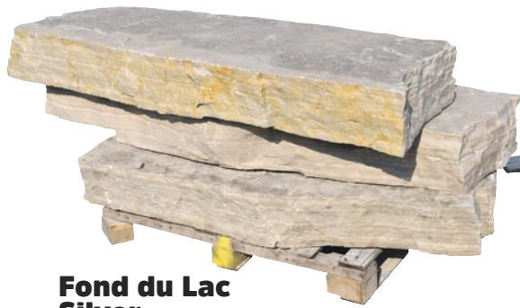
Fond du Lac Silver 5" to 8" thick