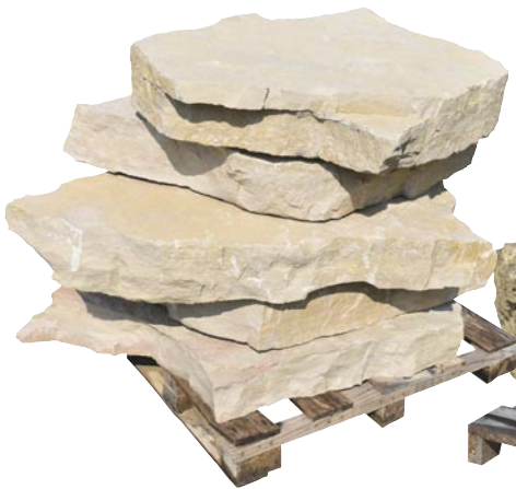
Fond du Lac Buff 5" to 8", 8" to 12" and 12"+ thick