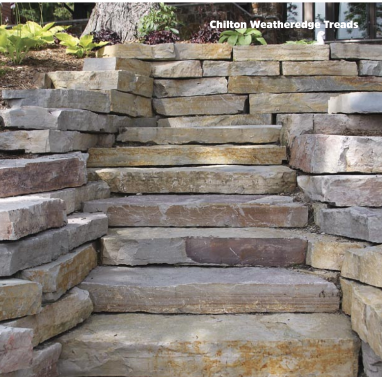
Chilton Weatheredge Treads