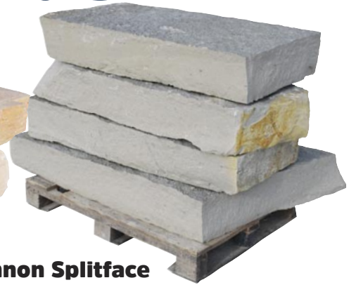
Lannon Splitface Buff or Grey Natural quarry run 5" to 8" thick