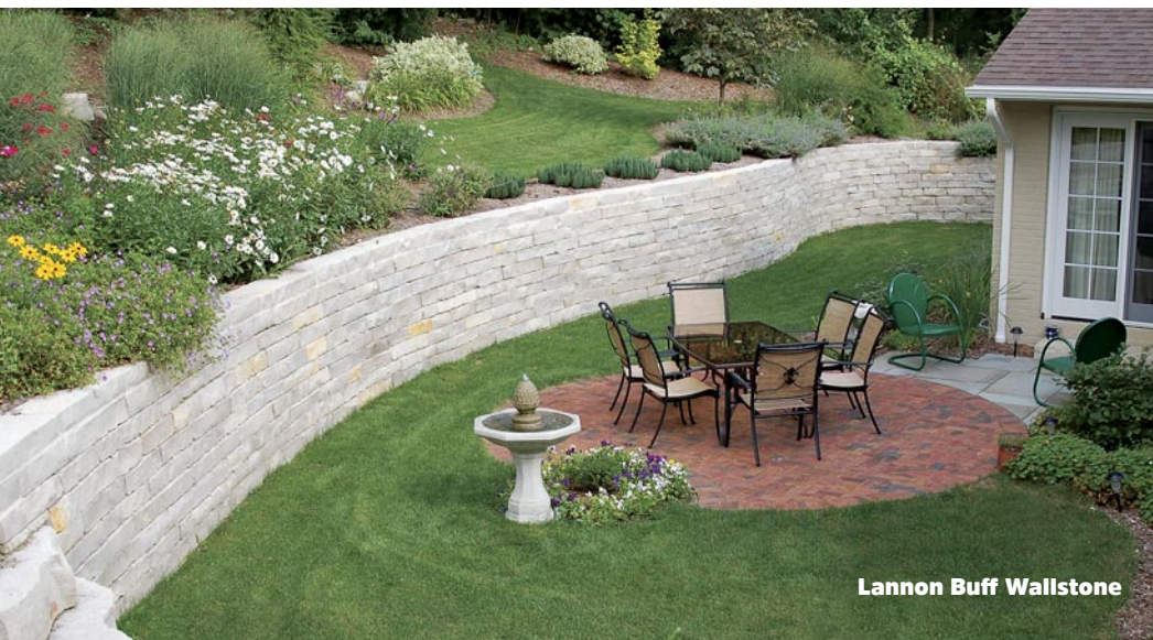
Lannon Buff Wallstone