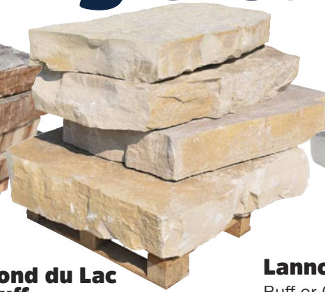
Fond du Lac Buff 5" to 8" thick