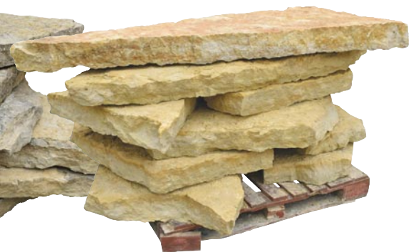
Beaver Creek Weatheredge 4" to 8" thick