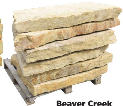
Beaver Creek 5" to 8" thick