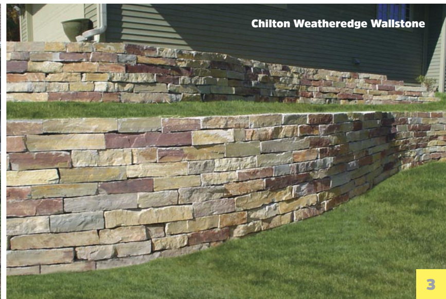
Chilton Weatheredge Wallstone