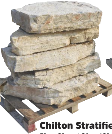
Chilton Stratified 5" to 8" and 8" to 12" thick